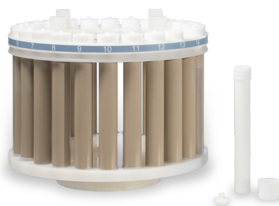
Figure 2 – MAXI-24 HP Rotor

and throughput rotor available in the market. The completely new design of its vessels allows to achieve conditions never seen for high throughput rotors. Thicker high purity PTFE-TFM vessels and caps, along with rugged PEEK shields are key ingredients to handle the conditions required to completely digest these samples.