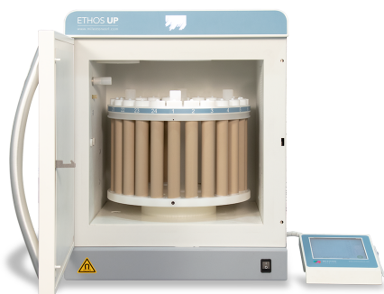
Figure 1 – Milestone's ETHOS UP

The ETHOS UP is the most advanced microwave sample preparation equipment, it meets the requirements of modern analytical labs.