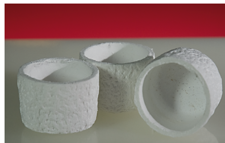
Picture 2 Milestone UltraFAST crucibles

Any type of crucible (metal, porcelain, quartz, etc.) can be used and for this test we have used the Milestone UltraFAST crucibles (Picture 2).