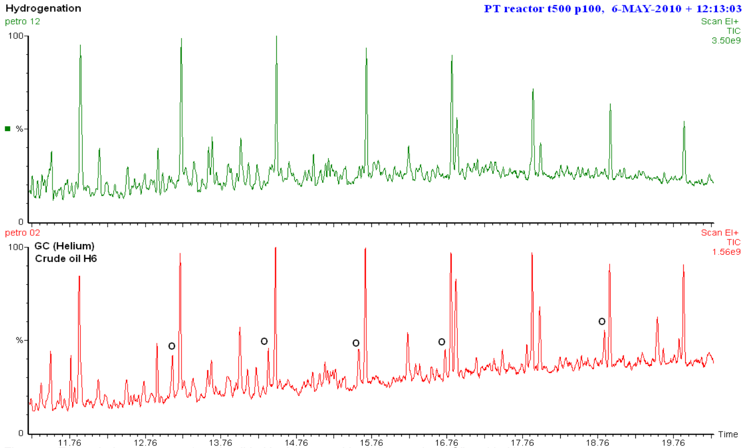
Figure 2: Expanded pyrograms of crude oil in He, bottom, with olefins marked "O" and in H2, top.

Column: 30m x 0.25 mm 5% phenyl Carrier: Helium, 50:1 split Program: 40°C for 2 minutes, 10°/min to 300°C Detector: MSD Mass range: 35 to 600 amu