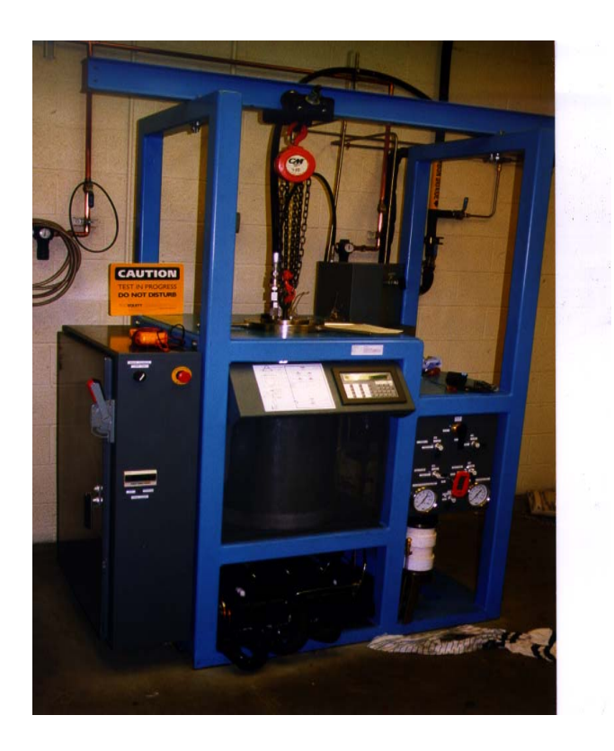
FIGURE 3. A 20-LITER EXTRACTION VESSEL UNIT (SFT, INC.) SCALE UP WORK