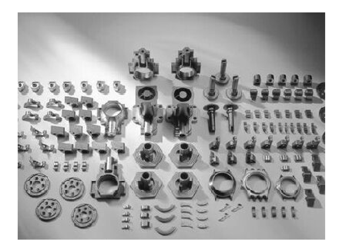
FIGURE 1. TYPICAL PARTS PRODUCED BY POWDER INJECTION MOLDING {\rm (PIM)}^{\rm b}